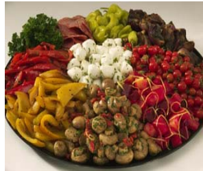
Antipasto Platter $55 $75 $95 Chicken Wings Platter $30 $45 $60